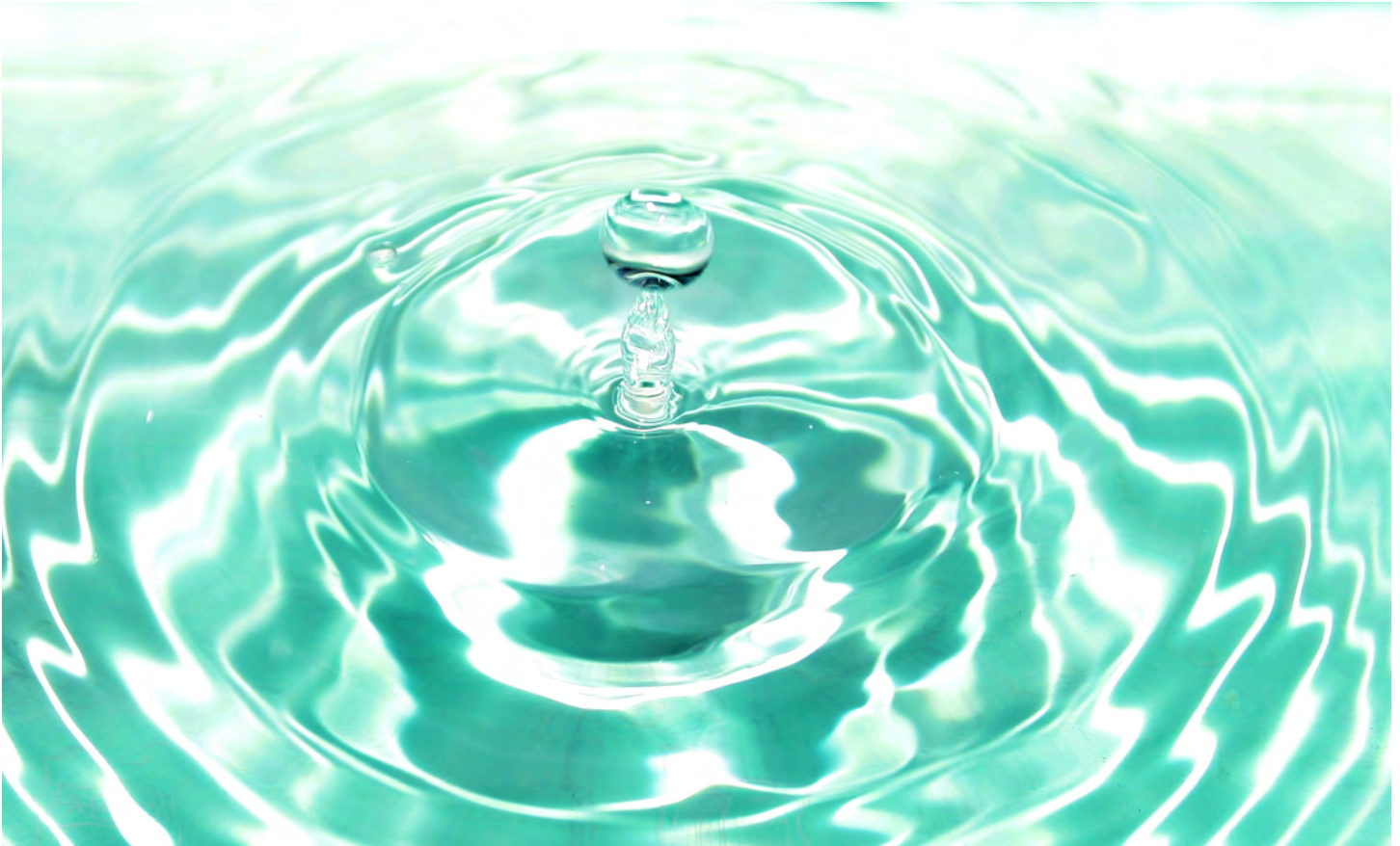
Figure 10: Tips and Strategies for Reviewing Policies

When evaluating policies or rules, here are some helpful criteria: